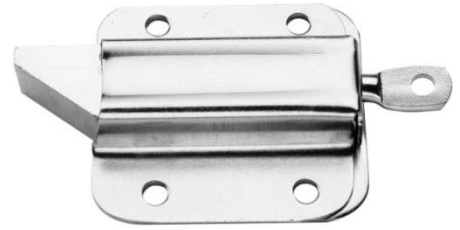
GD10-G01455 (LH, with plain bolt-pull. Bolt adjusted to 17 mm, minimum projection)