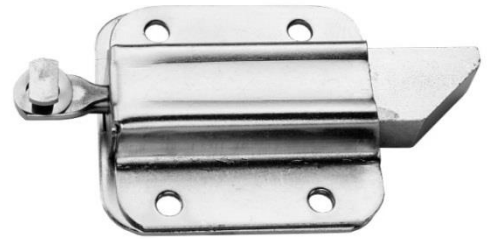
GD10-G01458 (RH, with 'quick-fit' attachment point. Bolt adjusted to 25 mm, maximum projection)